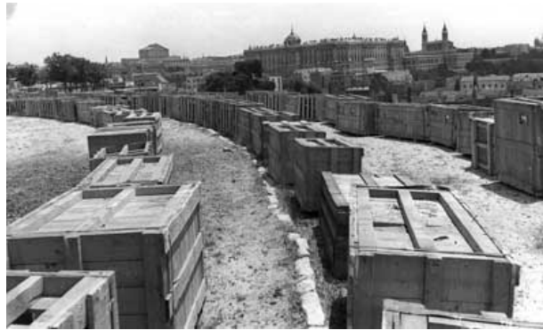
Cuartel de la Montaña

The 1,356 stone blocks that had been brought from Egypt were placed in concentric circles at the site of the Cuartel de la Montaña barracks, where they waited to be reassembled. But before that it was necessary to do some groundwork, demolishing some parts of the old barracks and laying the foundation for the monument.